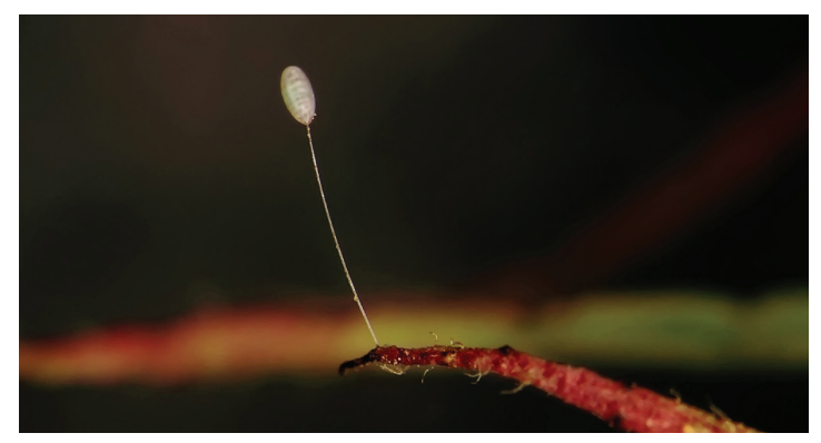
Chrysoperla carnea egg.